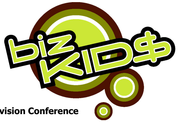
Example: Biz Kid$ Booth at the American Public Television Conference